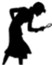
Let's check this out.

You know the emails that contain propaganda and lies that people repeat so much that most people assume they're true? Start with them. Run them through a Deception Inspection . Don't repeat claims that a third-grader who had a few hours of training in reason and logic could bust.