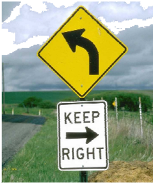
Thanks for the advice!

Who do you believe? If you listen to two different people describe what's going on in Iraq, you think you're going crazy. The contrast is like you stepped into alternative universes on the Twilight Zone. It leaves you dazed and confused. Guess what – that's the point – and why they call it spin.