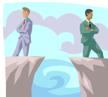
Perhaps if I ignore them, they'll go away.

Sure, politicians, pundits and political developed the fine art of divide and our families, neighbors and coworkers and treat political conversations like wars most Americans can't remember the last time they had a productive, informative, substantive political dialogue with someone who didn't already agree with them.