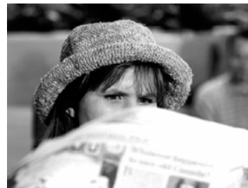
I've seen this before...

You're in danger, but there's nothing hit the brakes but the car goes faster. a road, but all you see is darkness. Is